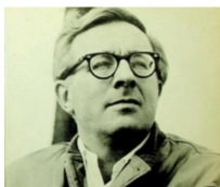
Many Authors Use