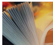
Name's Book That Made a Different